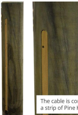
The cable is concealed by a strip of Pine Hardwood