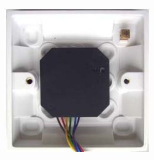
Internal wireless module